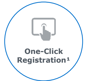
One-Click Registration 1

Creating individual course schedules that account for all of life's obligations, allowing students to balance school work with other priorities